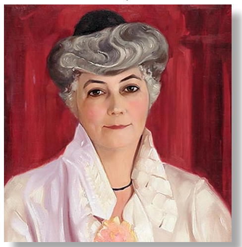
Helena Roerich, by Svetoslav Roerich

"You write about caution, but who knows the need for it better than I? But I know also of courage, of creative daring, and first of all, of great balance. Therefore, caution should